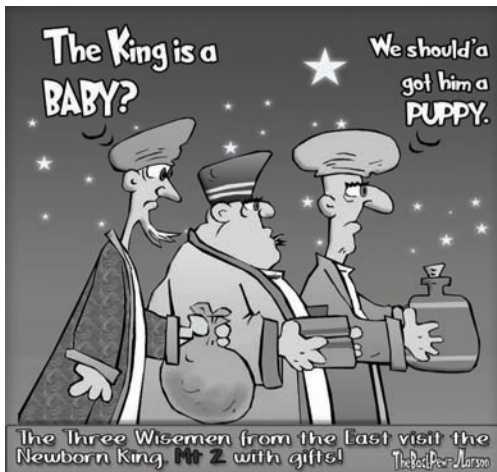
The Three Wisemen from the East visit the Newborn King, Mt Z with gifts! TheRedPawLion.com